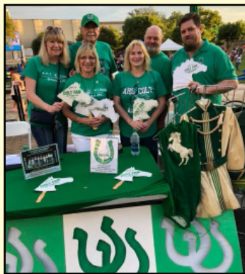
Band and Association folks working the booth on North Texas Giving Day

Last September the AHS Alumni Band and the AHS Alumni Association joined forces to participate in North Texas Giving Day. Sponsored by the Arlington Tomorrow Foundation and offered to area organizations, this combined fundraising effort is the nation's largest event of its kind. In addition to the online donations of $938.62 earmarked solely for our two alumni groups, all participating groups received $512 from the sponsors. Even better, we were one of four groups which won a drawing for an additional $5,000 which was split between the Association and the Band.